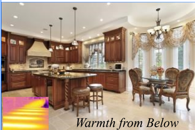
Warmth from Below

Add Warmth and Comfort to any space with an Energy Efficient ThermaRay Heating System