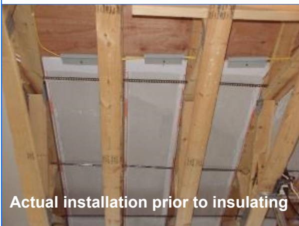
Actual installation prior to insulating